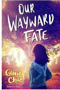
Our Wayward Fate