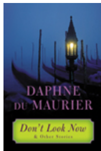
Don't Look Now and Other Stories