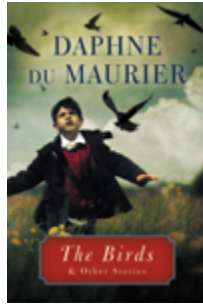
The Birds and Other Stories