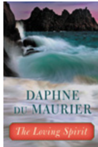
The Loving Spirit