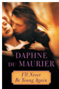
I'll Never Be Young Again