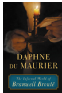
The Infernal World of Branwell Brontë