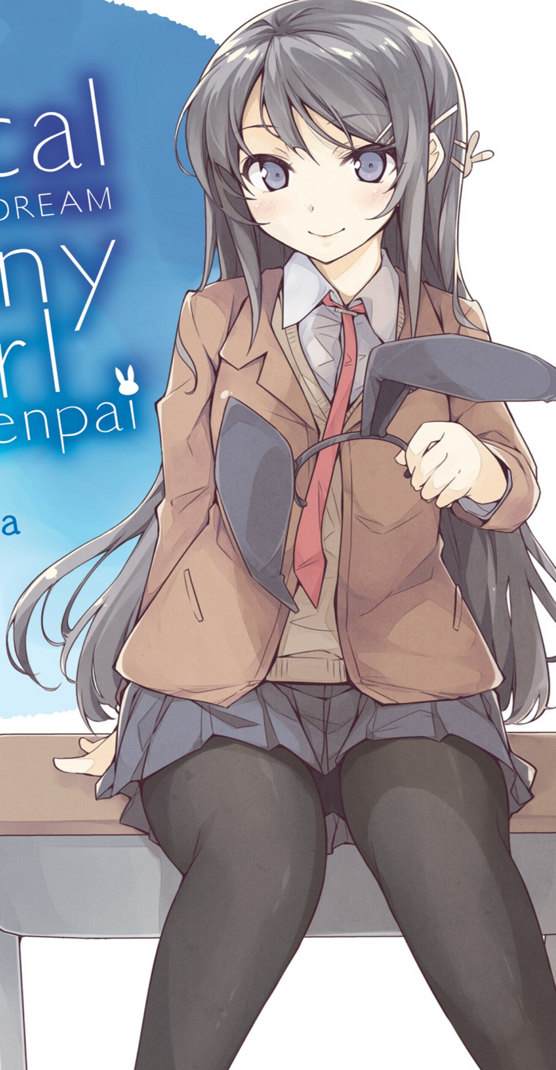
Illustration by Keji Mizoguchi