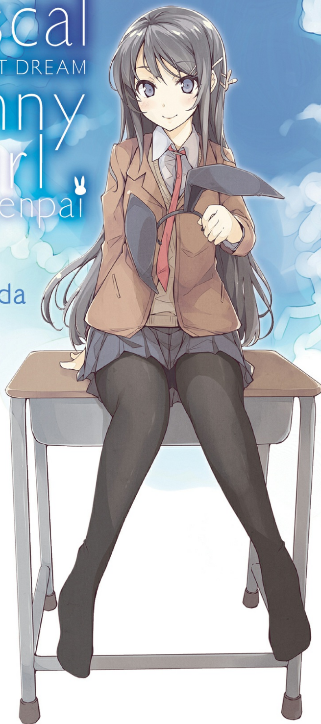
Illustration by KEJI MIZOGUCHI