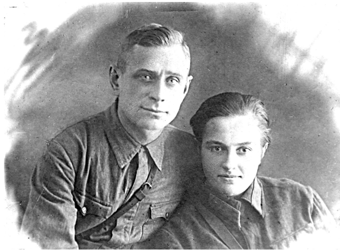
Lyonya Kitsenko and Lyudmila Pavlichenko, Sevastopol, January 1942