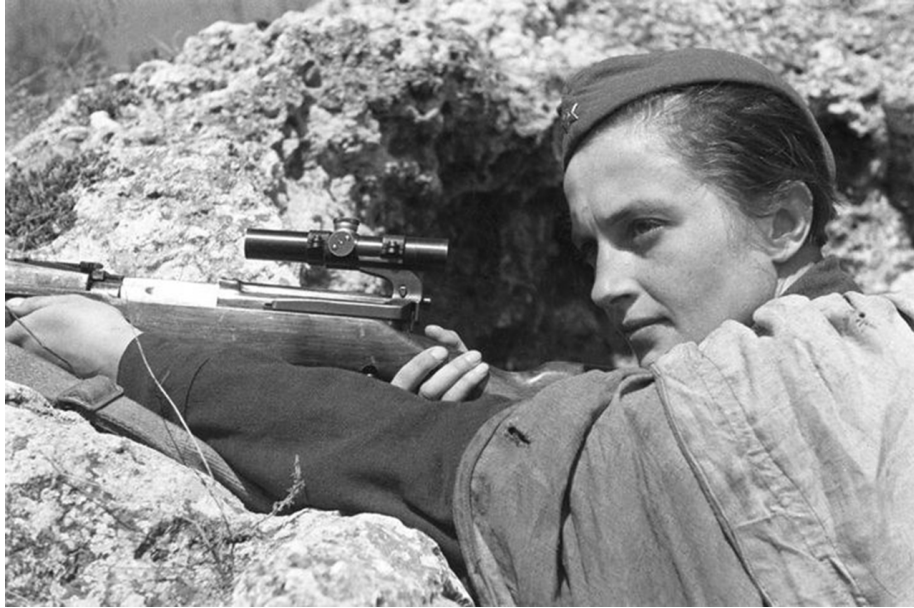
Lyudmila Pavlichenko, propaganda photograph, Sevastopol, early 1942