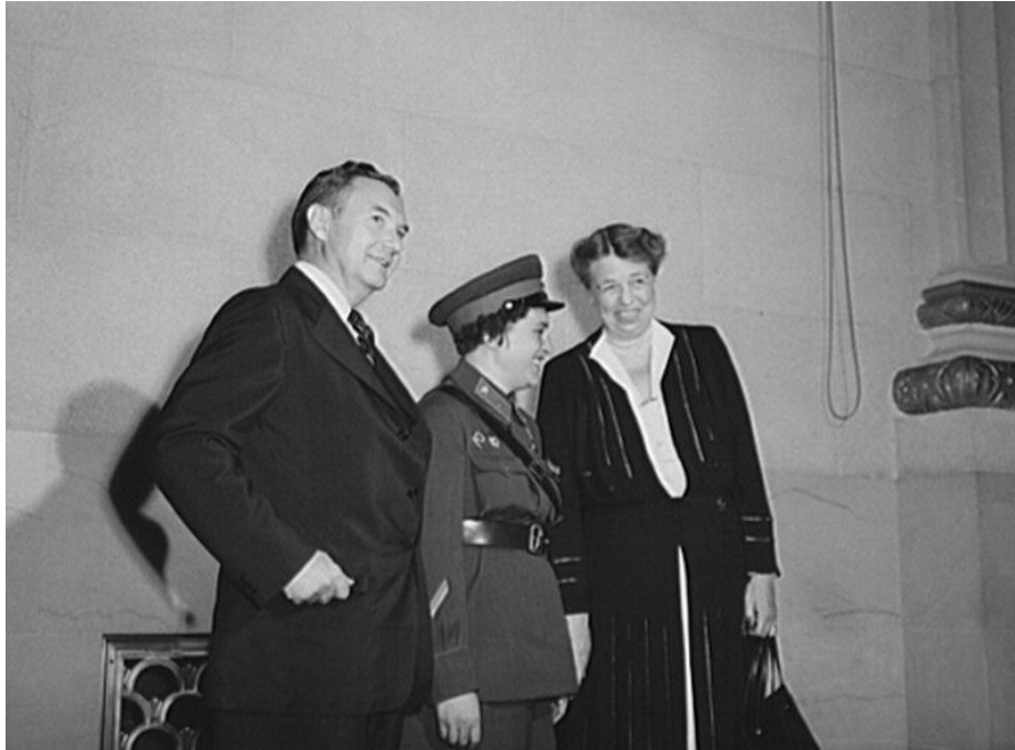
Lyudmila Pavlichenko and Eleanor Roosevelt, USA tour, 1942