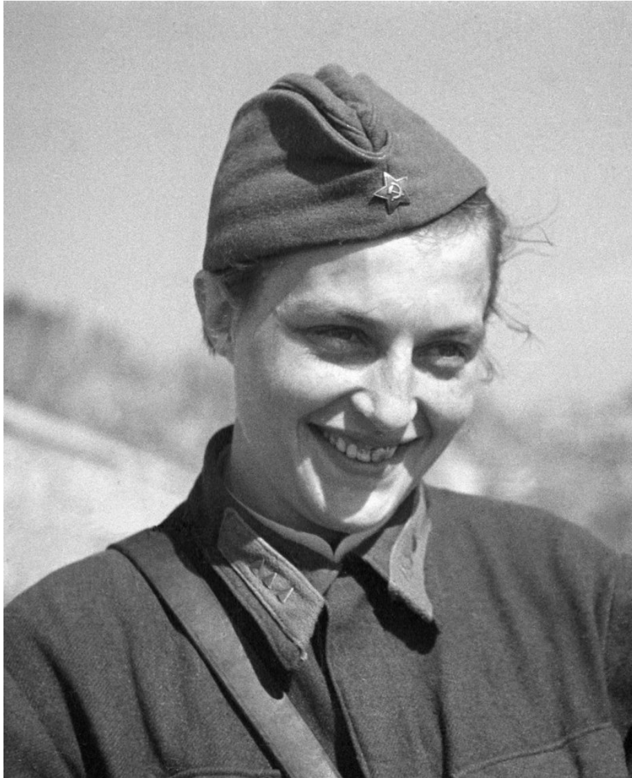
Lyudmila Mikhailovna Pavlichenko