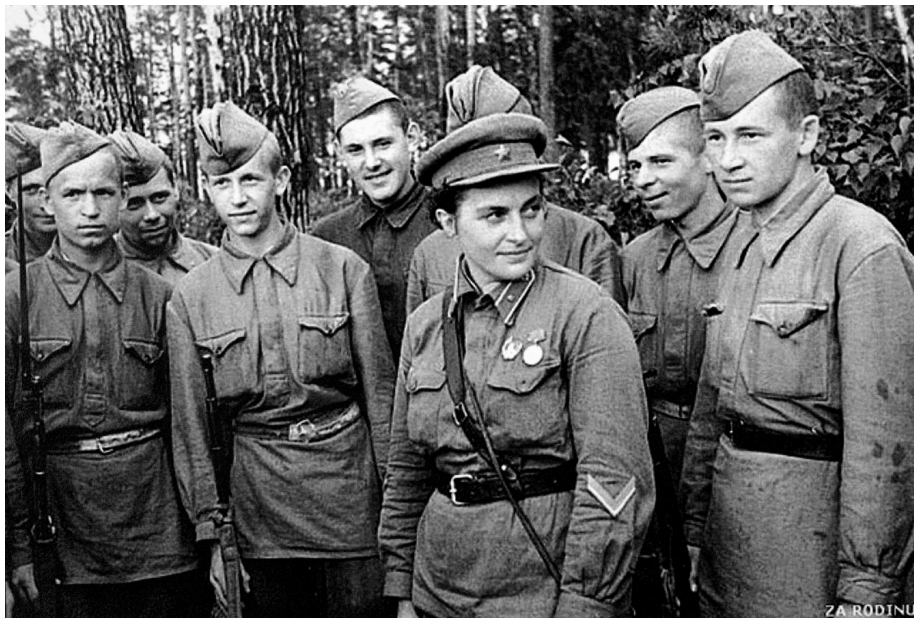
Sniper platoon commander Lyudmila Pavlichenko with her troops (32nd Guards Parachute Division), Moscow military district, August 1942