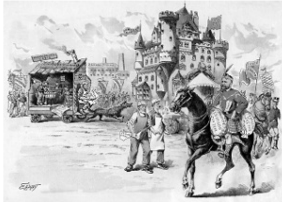
PUCK SUGGESTS A SUITABLE TABLEAU FOR THE PROCESSION IN HONOR OF THE UNCROWNED KING OF THE G.O.P.