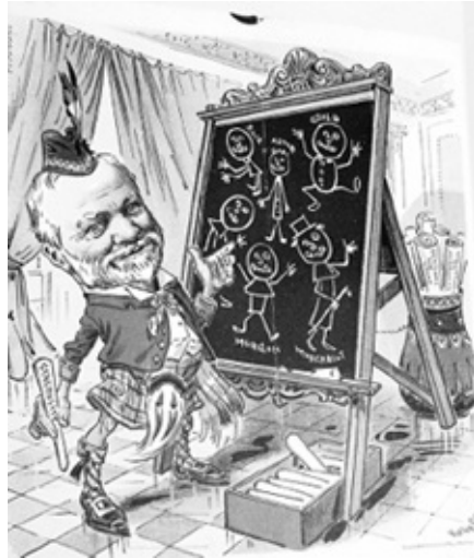
A BRAW LADDIE