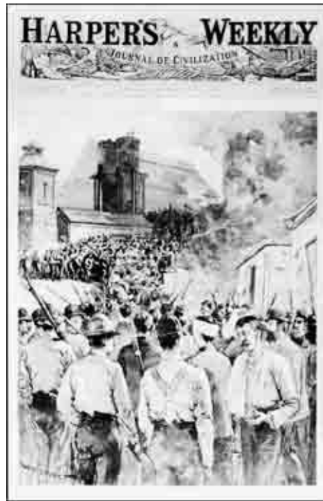
Harper's Weekly, July 14, 1892.

looking Pinkertons. Though the scene was indeed horrendous to watch and report on, the crowd was not nearly as bloodthirsty as the newspapers described it. While several Homestead workers died in the gunfire that preceded the surrender, no Pinkerton lost his life in the gauntlet. 40