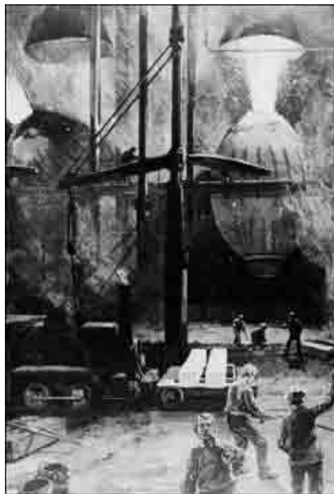
Making Bessemer Steel

impurities, which exited the top of the vessel in an avalanche of white flames and sparks. At this signal, a small amount of Spiegel, an iron compound with a high percentage of manganese and carbon, was added to the mix, “carburizing” the purified iron and converting it into steel. The vessel was then tipped onto its side, pouring white-hot liquid steel into a casting ladle, which conveyed it to the molds.