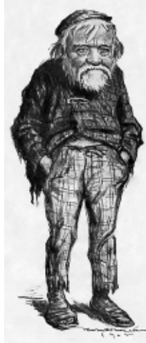
WHEN MR. CARNEGIE'S MONEY IS GONE.