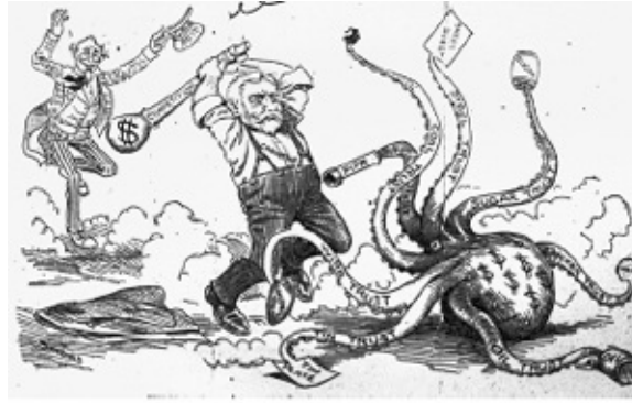
UNCLE SAM: "GIVE IT TO 'IM, ANDY! GIVE IT TO 'IM!"

Pittsburg, January 6—Andrew Carnegie's decision to engage in the pipe business, as announced yesterday, it was stated here today means a war of millions between Carnegie on one side and J. Pierpont Morgan and the railroad interests of the country on the other.