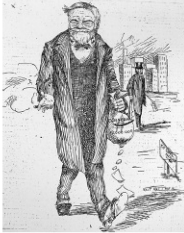
“TAKE THE CRUMBS, LITTLE BOY!”

The most spectacular revelations to come out of Frick’s lawsuit had to do with the outrageous profits Carnegie Steel had been generating as a “tariff-protected” manufacturer. Until Frick’s complaint, no one had any idea how profitable Carnegie Steel had become. Carnegie and Frick had kept these numbers secret because they knew they would provide union leaders, Democratic politicians, and antitariff men on both sides of the aisle with vital ammunition against protective tariffs for the steel industry. Now, in an instant, Frick ripped away the curtain, revealing that Carnegie Steel had earned net profits of $21 million in 1899, and that he and Carnegie expected those profits to rise above $40 million for 1900.