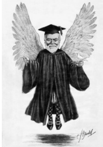
OUR ANGEL OF PEACE

Carnegie remained oblivious to it all, his attention fixed fast on the treaties of arbitration, first with Britain and France, then Germany and the rest of the world. At long last his dreams were to be realized. “What a hit...I imagine you,” he wrote Knox on May 11, “pen in hand, signing the greatest document [the first arbitration treaty] in its influence upon the world ever signed. Your piloting superb. I am rejoicing that I live in these days.” That same day, he wrote the president a similar fawning letter of congratulations. “Consummate statesmanship, Mr. President—France, our Sister Republic, and Britain our fellow of the English speaking race on equal terms with the door wide open for other powers.” 55