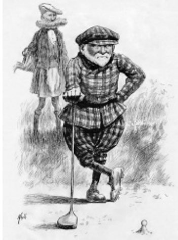
A GALLERY OF GOLF ENTHUSIASTS