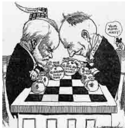
THE CHECKER PLAYERS

The “deed” could have been written by no one else. Certainly no one else would have dared to sprinkle through a legal document words like “hav,” “giv,” “dauter,” and other “simplified spellings.” Carnegie made the purpose of his new trust eminently accessible to anyone who cared to read his letter: “Although we no longer eat our fellow men nor torture prisoners, nor sack cities killing their inhabitants, we still kill each other in war like barbarians. Only wild beasts are excusable for doing that in this, the twentieth century of the Christian era, for the crime of war is inherent, since it decides not in favor of the right, but always of the strong. The nation is criminal which refuses arbitration.” 42