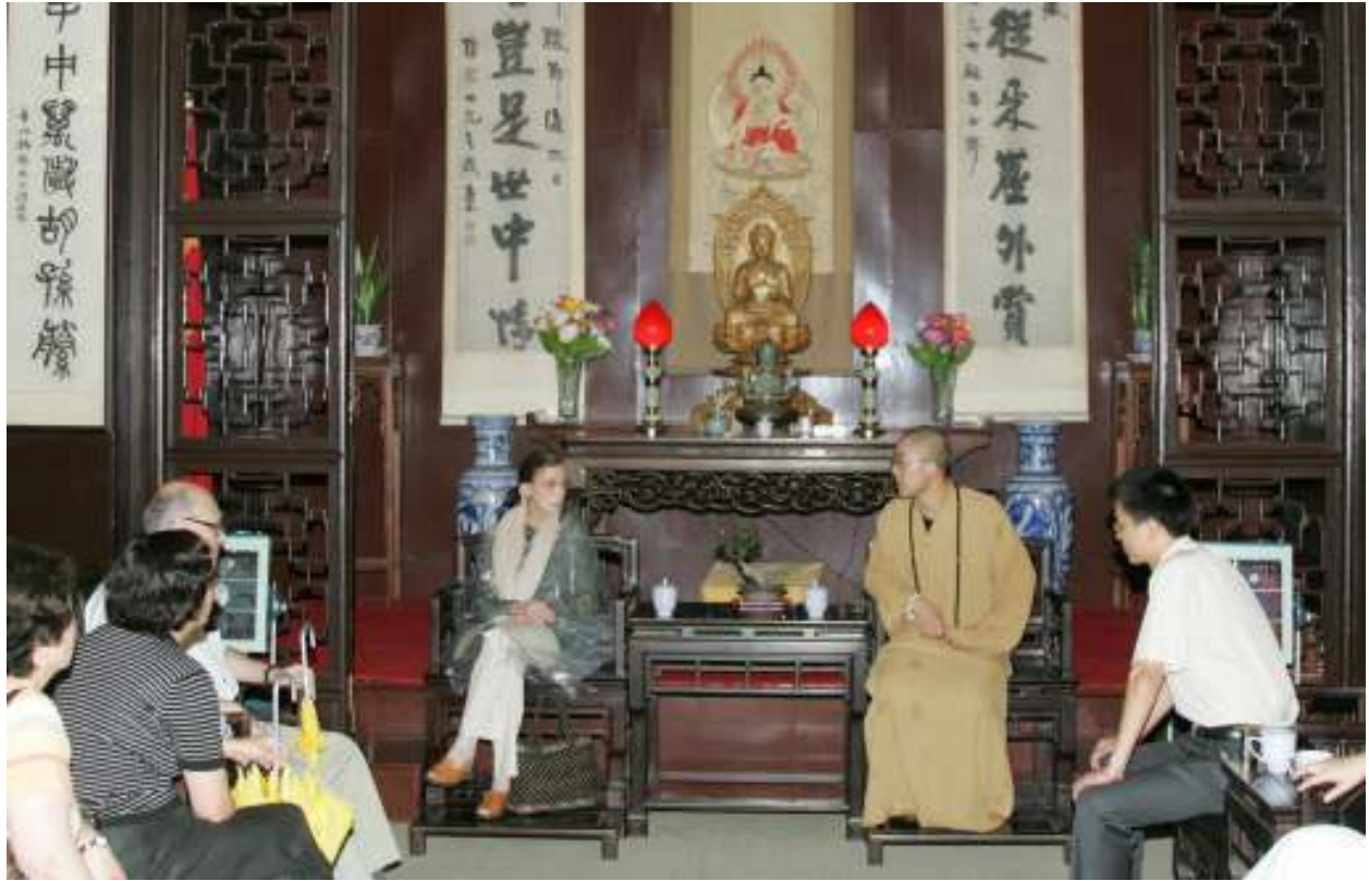
(13) Justice Ginsburg meets with a Buddhist abbot at the Lingyin Temple in Hangzhou, Zhejiang Province, during a 2005 trip to China.