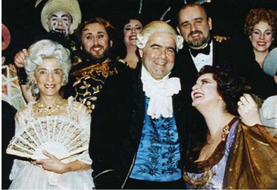
Justice Ruth Bader Ginsburg (wearing a white dress and holding a fan on the left) and Justice Antonin Scalia (wearing a blue vest and a wig on the right) photographed during a production of Richard Strauss's opera Ariadne auf Naxos. The Justices appeared as supernumeraries in the Washington National Opera's opening night production at the Kennedy Center in Washington, D.C., on January 7, 1994.

I. These remarks have been edited and updated to include additional thoughts and memories that Justice Ginsburg shared in later tributes about Justice Scalia.