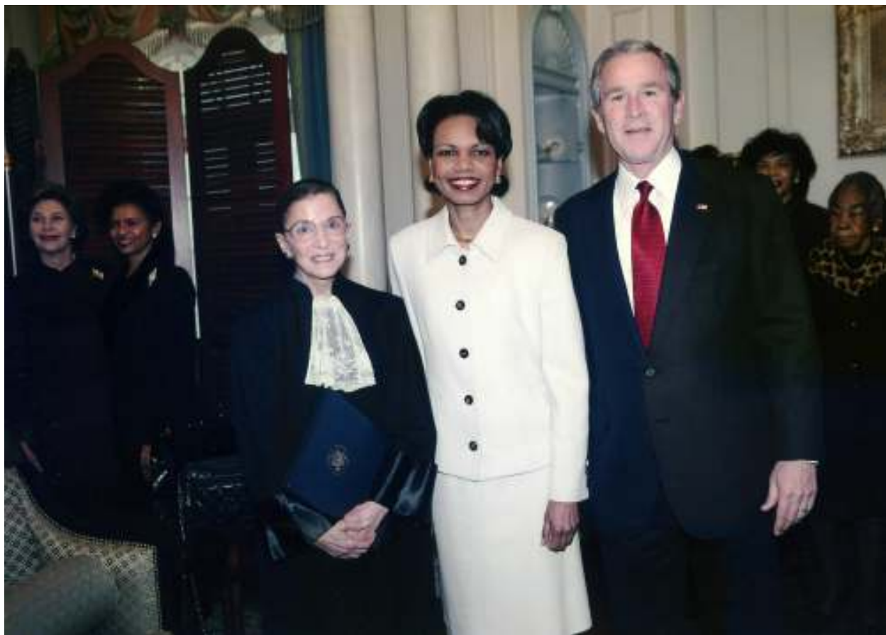
(12) Justice Ginsburg with President George W. Bush and Secretary of State Condoleezza Rice at the Department of State on January 28, 2005, the day Justice Ginsburg swore Rice in as Secretary of State.