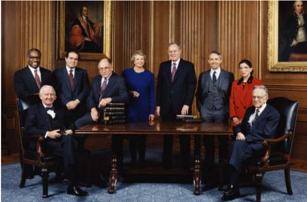
(10) Official informal group photograph of the Supreme Court as composed under Chief Justice William H. Rehnquist, taken in the West Conference Room on December 3, 1993. Seated in the chair on the left is Justice John Paul Stevens and in the chair on the right is Justice Harry A. Blackmun. Standing from left to right are Justices Clarence Thomas, Antonin Scalia, Chief Justice Rehnquist, and Justices Sandra Day O'Connor, Anthony M. Kennedy, David Souter and Ruth Bader Ginsburg.