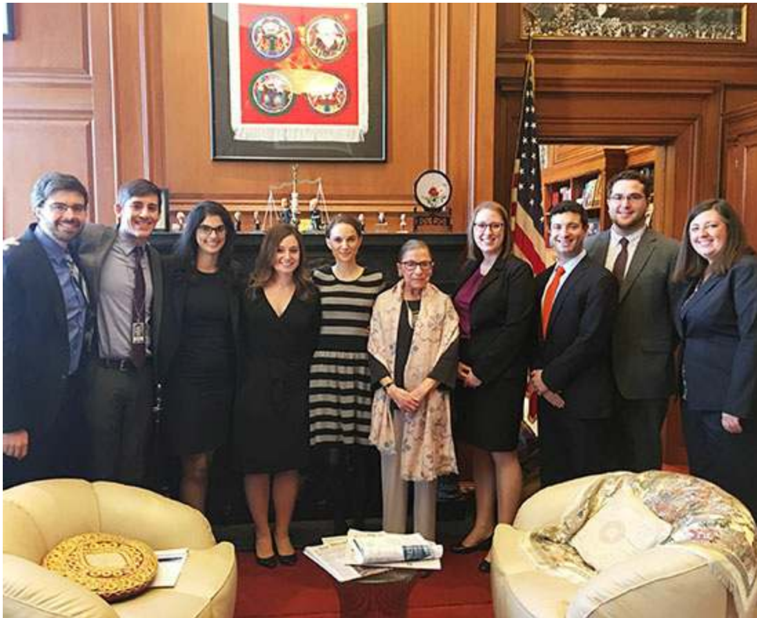
Justice Ginsburg in her Chambers with her October Term 2015 law clerks, Chambers staff and Natalie Portman, February 29, 2016.

Justice Ginsburg works out on elliptical during a training session at the Supreme Court, sporting her “Super Diva” sweatshirt. August 30, 2007.