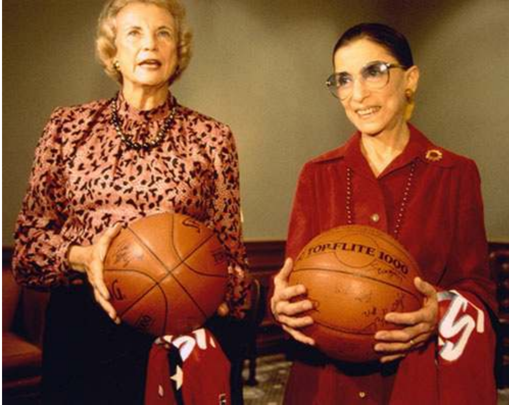
Justices Sandra Day O'Connor and Ruth Bader Ginsburg hold basketballs that they received as gifts from the United States women's Olympic basketball team during the team's visit to the Court on December 6, 1995.

I. These remarks were delivered at the National Museum of Women and the Arts in Washington, D.C., on April 15, 2015, when Justice Ginsburg, together with Justice Sotomayor and Justice Kagan, attended a ceremony at which retired Justice Sandra Day O'Connor accepted an award from the Seneca Women Global Leadership Forum. We have edited the remarks for length and to ensure clarity outside the specific context in which they were originally delivered.