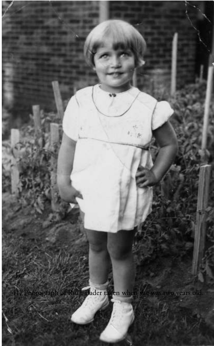
(1) Photograph of Ruth Bader taken when she was two years old.