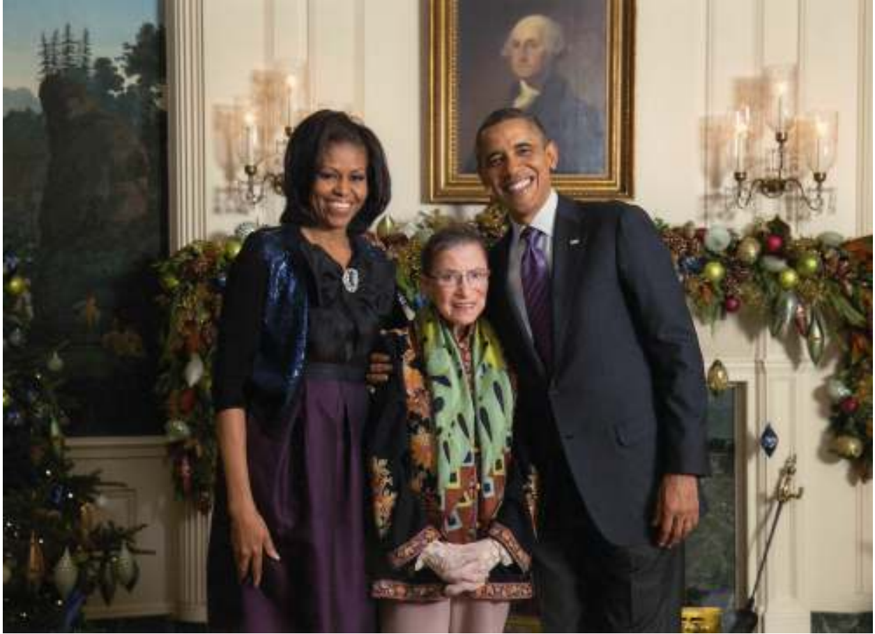
(11) Justice Ginsburg with President Barack Obama and First Lady Michelle Obama at the White House.