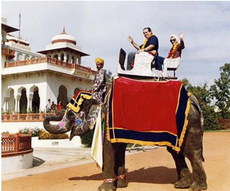
Justice Scalia and Justice Ginsburg pose on an elephant in Rajasthan during their tour of India in 1994.

In his preface to the libretto of the opera buffo Scalia/Ginsburg , Justice Scalia described as the peak of his days in D.C. an evening in 2009 at the Opera Ball, at the British Ambassador's Residence, when he joined two Washington National Opera tenors at the piano for a medley of songs. He called it the famous Three Tenors performance. He was, indeed, a magnificent performer. How blessed I was to have a working colleague and dear friend of such captivating brilliance, high spirits, and quick wit. In the words of a duet for tenor Scalia and soprano Ginsburg, we were different, yes, in our interpretation of written texts, yet one in our reverence for the Court and its place in the U.S. system of governance.