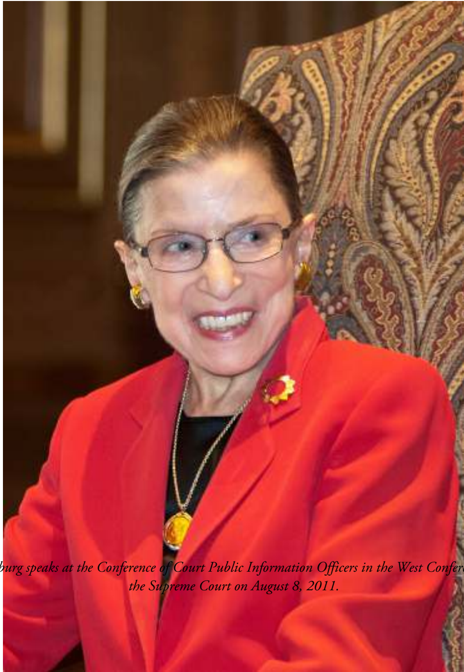
Justice Ginsburg speaks at the Conference of Court Public Information Officers in the West Conference Room at the Supreme Court on August 8, 2011.