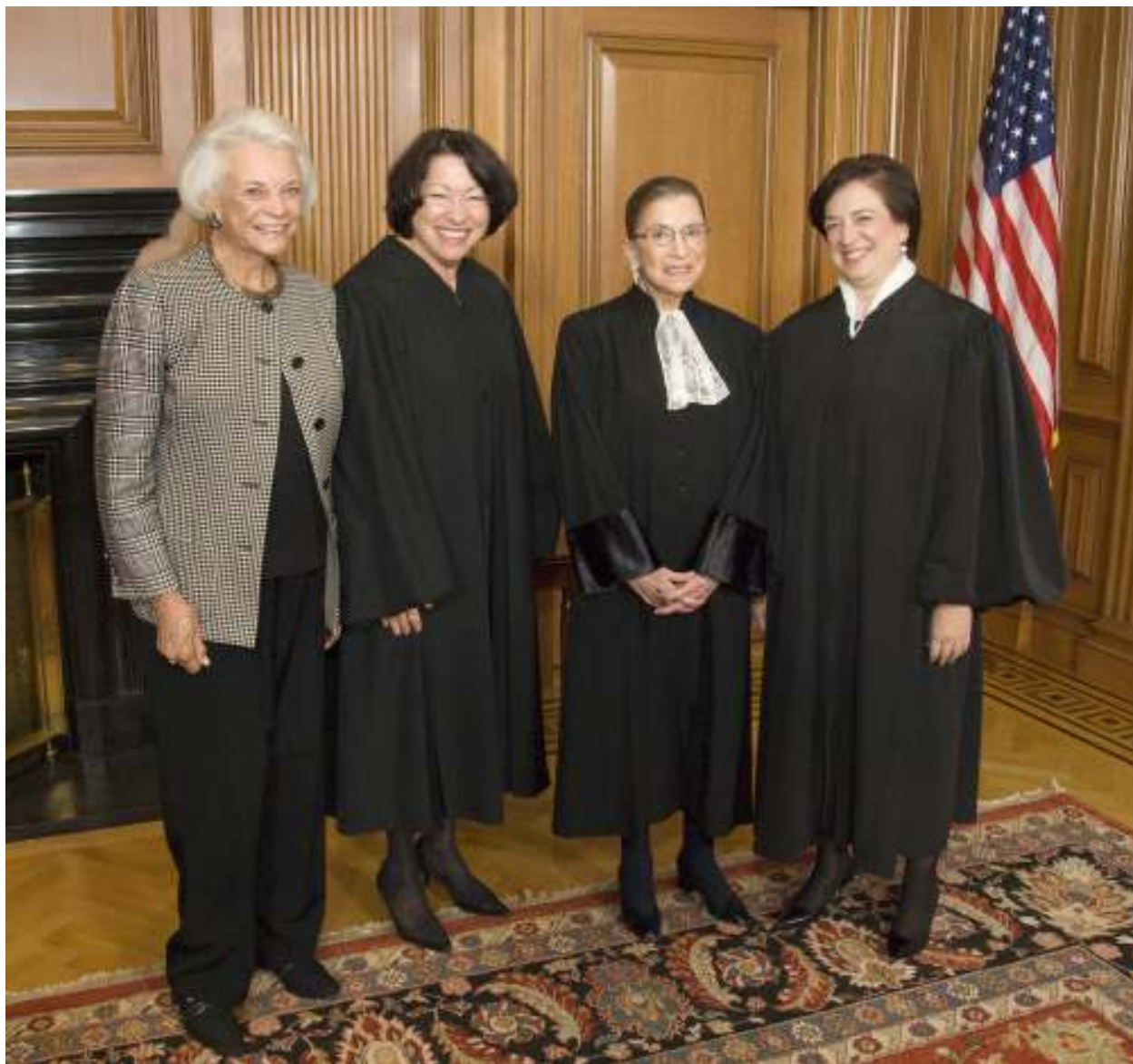
(16) The only women who have become Supreme Court Justices pose in the Justices' Conference Room on October 1, 2010, the day of Justice Elena Kagan's investiture. Standing, from left to right, are retired Justice Sandra Day O'Connor and Justices Sonia Sotomayor, Ruth Bader Ginsburg, and Elena Kagan.