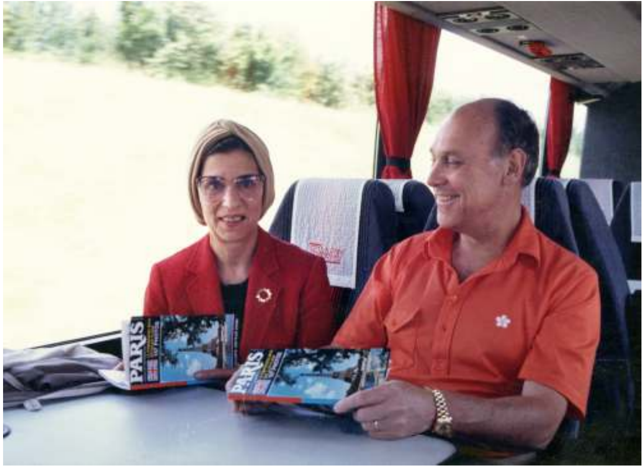
(7) Ruth Bader Ginsburg and Marty Ginsburg travel by bus from Charles de Gaulle Airport to downtown Paris, circa 1988.