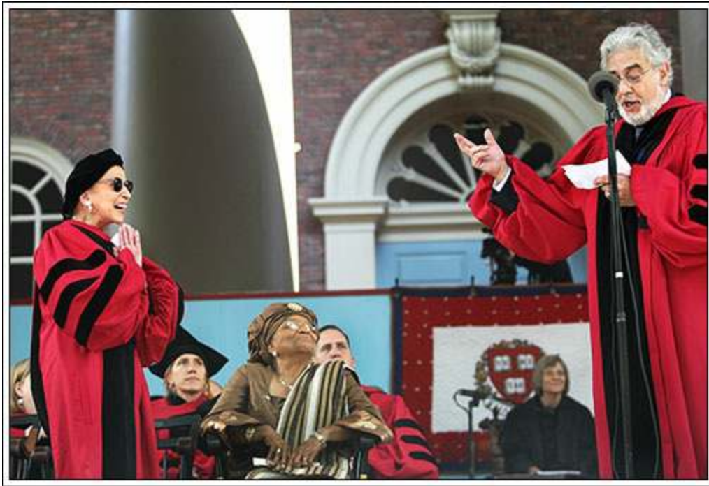
Justice Ginsburg is serenaded by opera singer Plácido Domingo while the two receive honorary degrees from Harvard on May 26, 2011.

surprise when, in 2011, she traveled to Harvard to accept an honorary degree and fellow awardee Plácido Domingo serenaded her as part of the degree conferral.