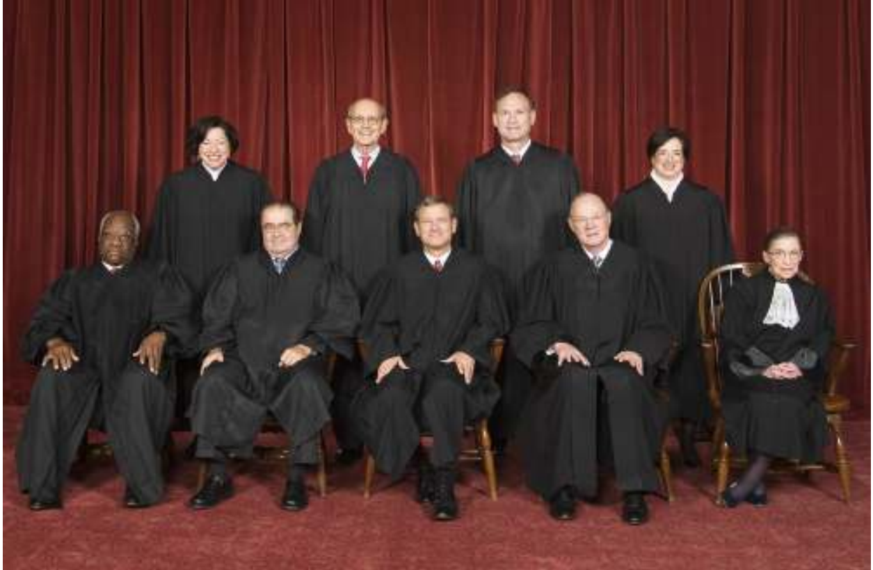
(14) Formal group photograph of the Supreme Court as comprised from 2010 until Justice Scalia's death on February 13, 2016. The Justices are posed in front of red velvet drapes and arranged by seniority, with five seated and four standing. Seated from left are Justices Clarence Thomas and Antonin Scalia, Chief Justice John G. Roberts, Jr., and Justices Anthony M. Kennedy and Ruth Bader Ginsburg. Standing from left are Justices Sonia Sotomayor, Stephen G. Breyer, Samuel A. Alito, and Elena Kagan.