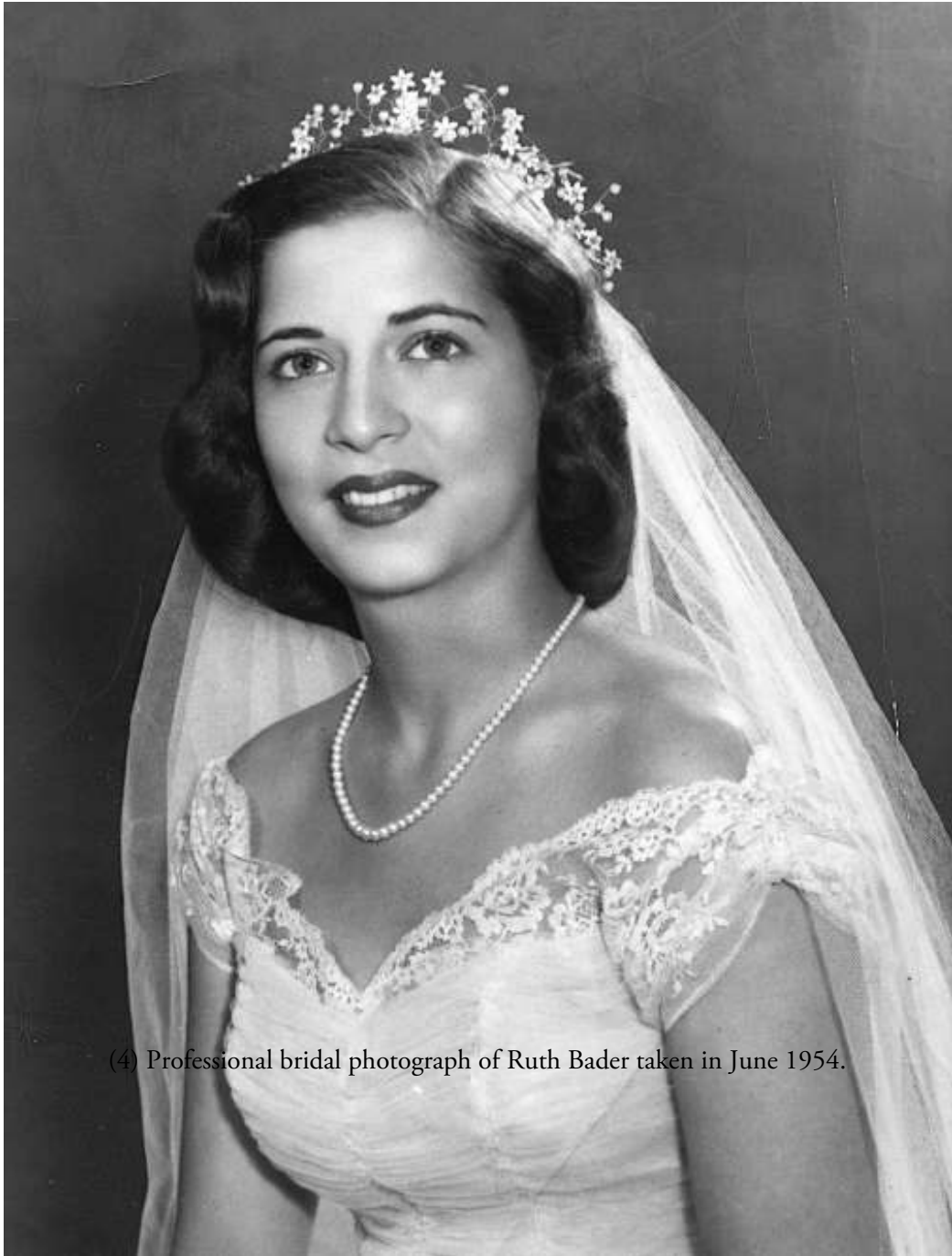
(4) Professional bridal photograph of Ruth Bader taken in June 1954.