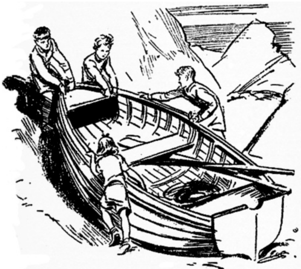
With much panting and puffing, they hauled the boat round the rock

The others thought it would be worth while trying, anyway. So, with much panting and puffing, they hauled the boat round the rock, which almost completely hid her.