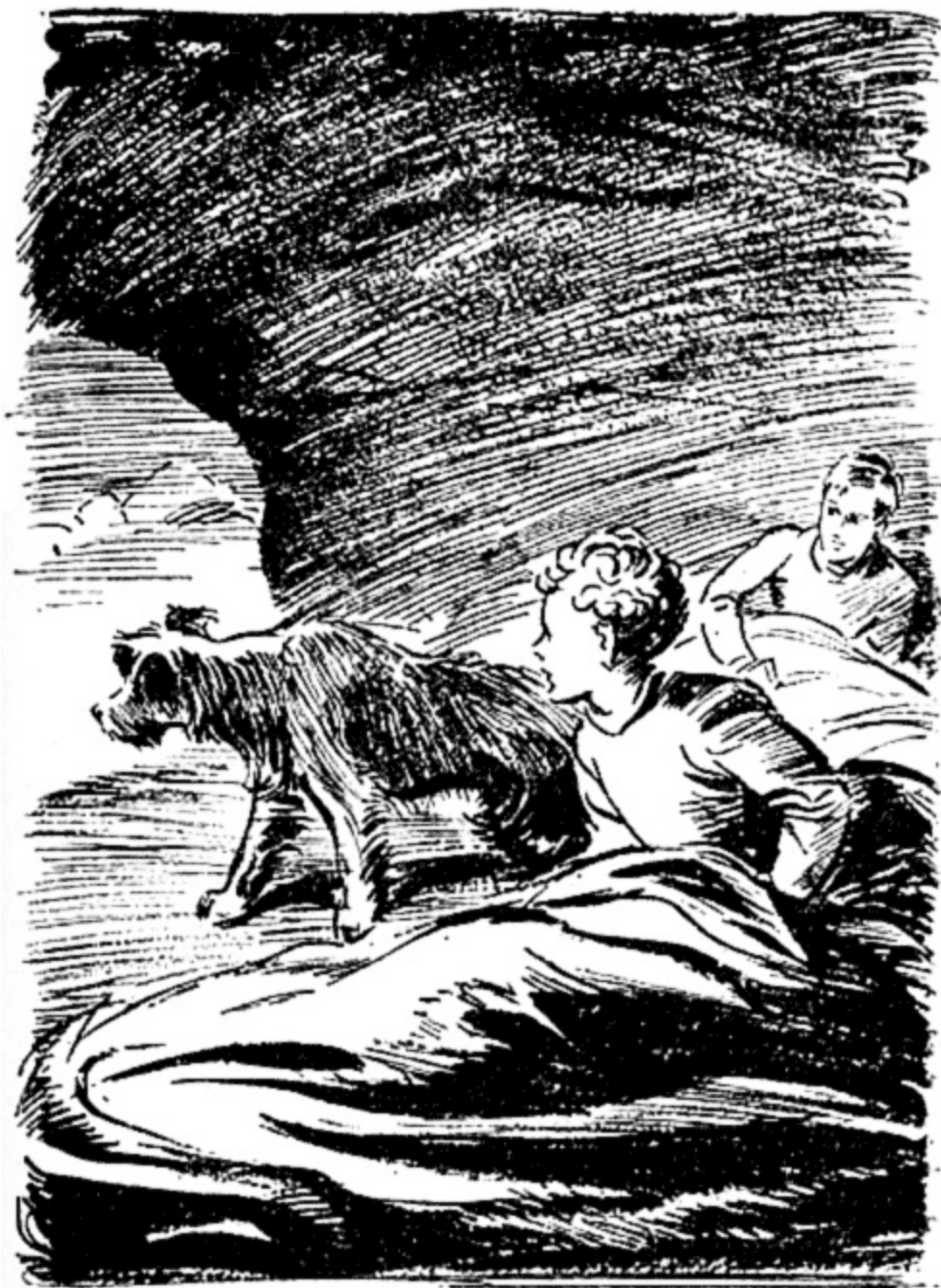
George sat up cautiously. Timmy was still growling

"Perhaps it's the smugglers come in the night," whispered George, and a funny prickly feeling ran down her back. Somehow smugglers in the day time were rather exciting and quite welcome - but at night they seemed different. George didn't at all want to meet any just then!