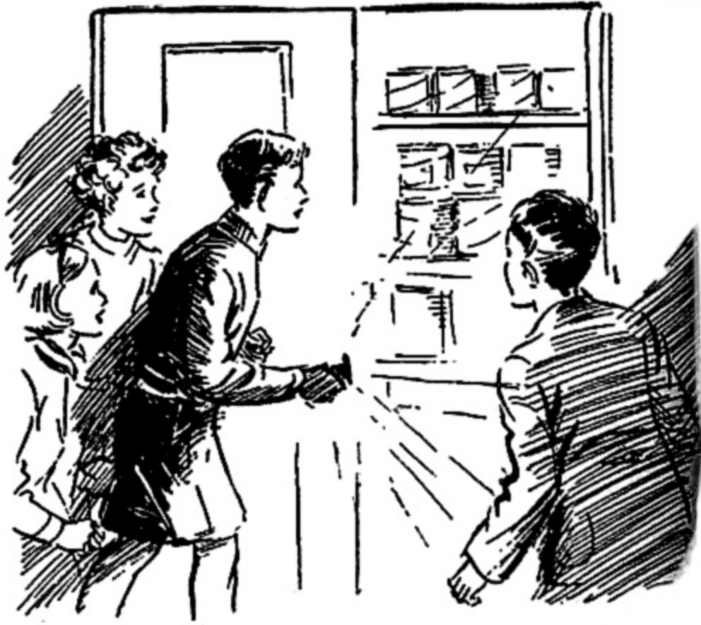
Julian shone his torch into the cupboard

"Golly!" said Dick, his eyes gleaming. "Soup - tins of meat - tins of fruit - tinned milk - sardines - tinned butter - biscuits - tinned vegetables! There's everything we want here!"