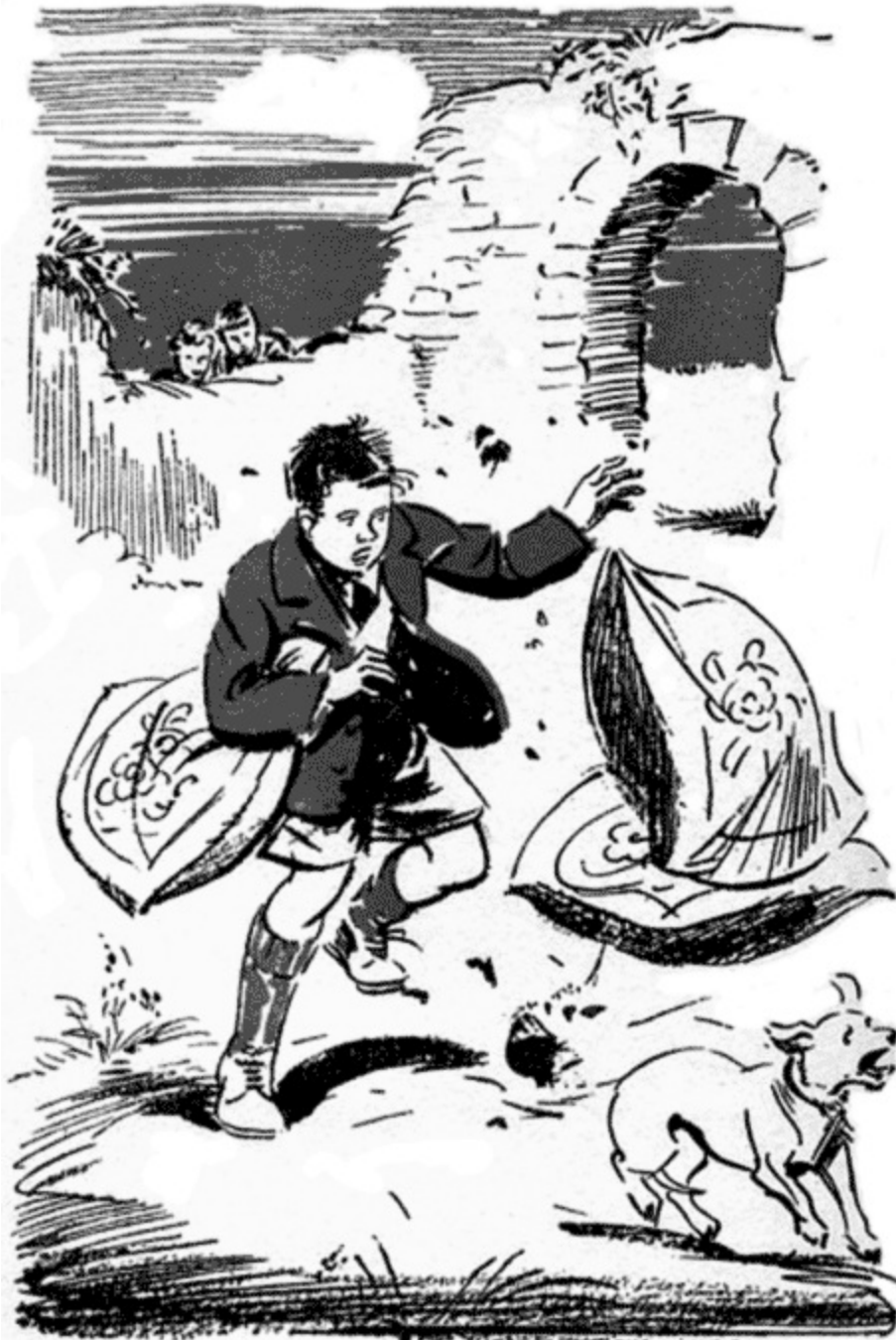
It fell between Edgar and Stinker, breaking into a shower of earth

Edgar dropped the cushions, and looked up into the air in fright. It was plain that he thought something had fallen from the sky. George picked up another clod, took aim, and flung it high into the air. It fell all over Stinker, and the dog gave a yelp, and scuttled down the hole that led into the dungeons.