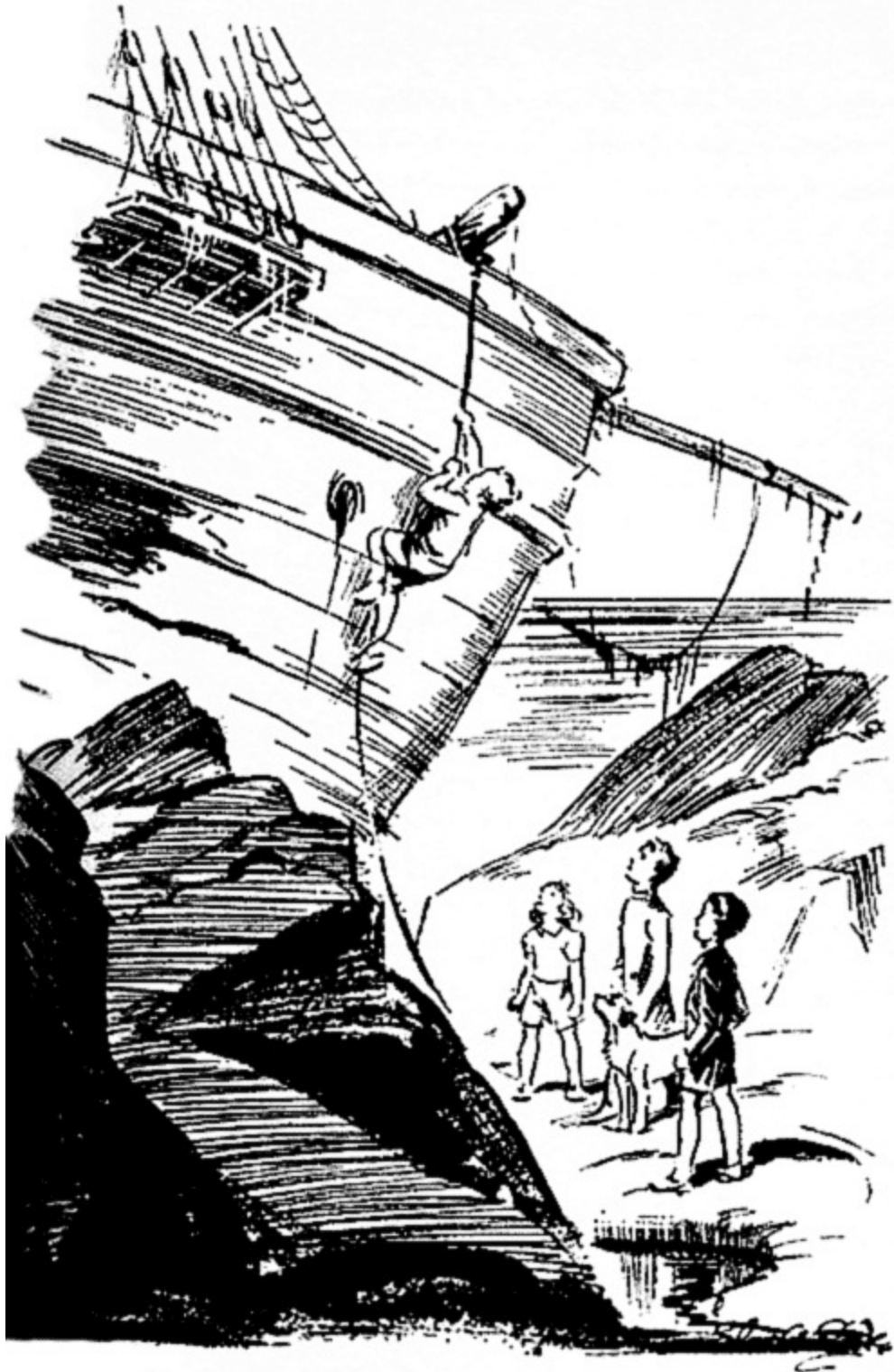
She was up the rope like a monkey

"It's a horrid smell, isn't it?" said Anne, wrinkling up her nose. "Do all wrecks