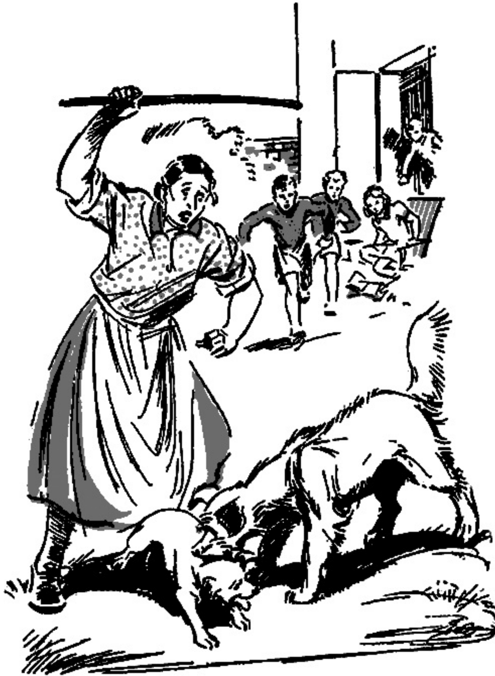
Mrs. Stick appeared with a stick and lashed out

The water gushed out, and Timothy gave a gasp and let go the howling mongrel he held in his teeth. Stinker at once hurled himself on Mrs Stick, and