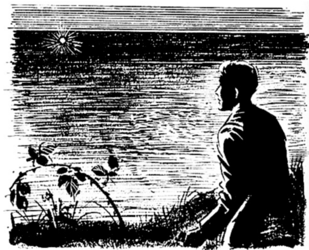
The signalling went on for a long time, as if a message was being flashed

The signalling went on for a long time, as if a message was being flashed. Julian could not for the life of him make out what it was. It simply looked like the flash-flash-flash of a lantern to him. But it must mean a signal or message of some sort to the Sticks.