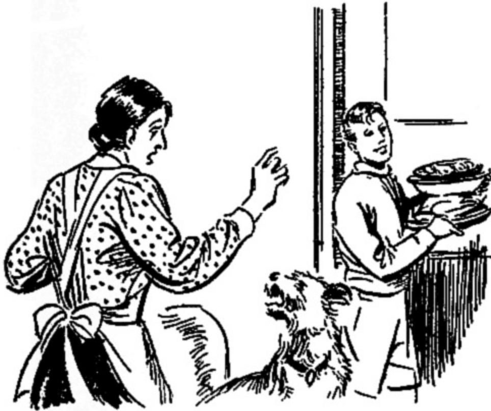
His teeth snapped together with a loud click

"Oh!" howled Mrs Stick. "That dog of yours nearly took my hand off! The brute! I'll do for him one day, you see if I don't."