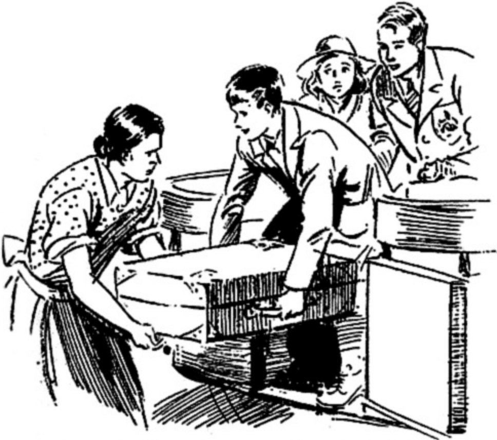
A sour-faced woman came out from the back door to help them down with their luggage