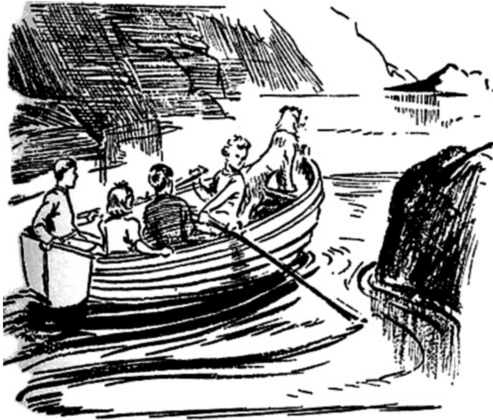
The others watched in admiration as the girl guided the big boat skilfully in and out of the hidden rocks

The boat slid into the little cove. It was a natural harbour, with the water running up to a stretch of sand. High rocks sheltered it. The children jumped out eagerly, and four pairs of willing hands tugged the boat quickly up the sand.