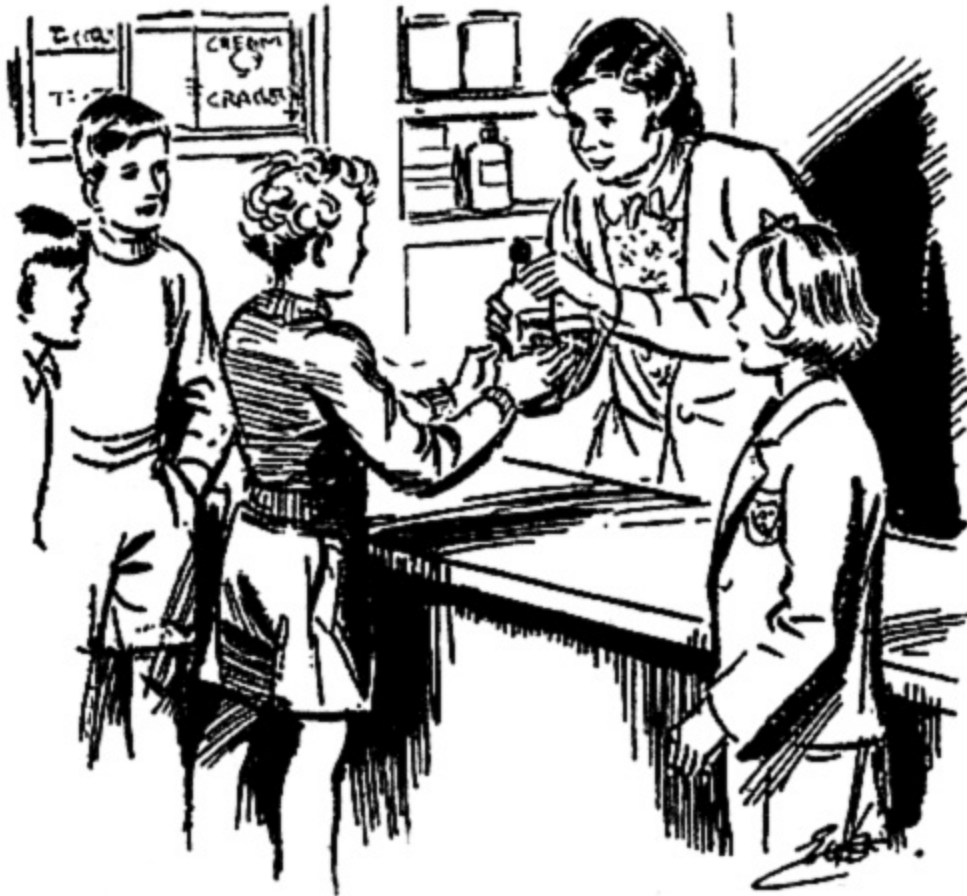
She bought two boxes of matches, and a bottle of methylated spirit

She bought two boxes of matches, and a bottle of methylated spirit.