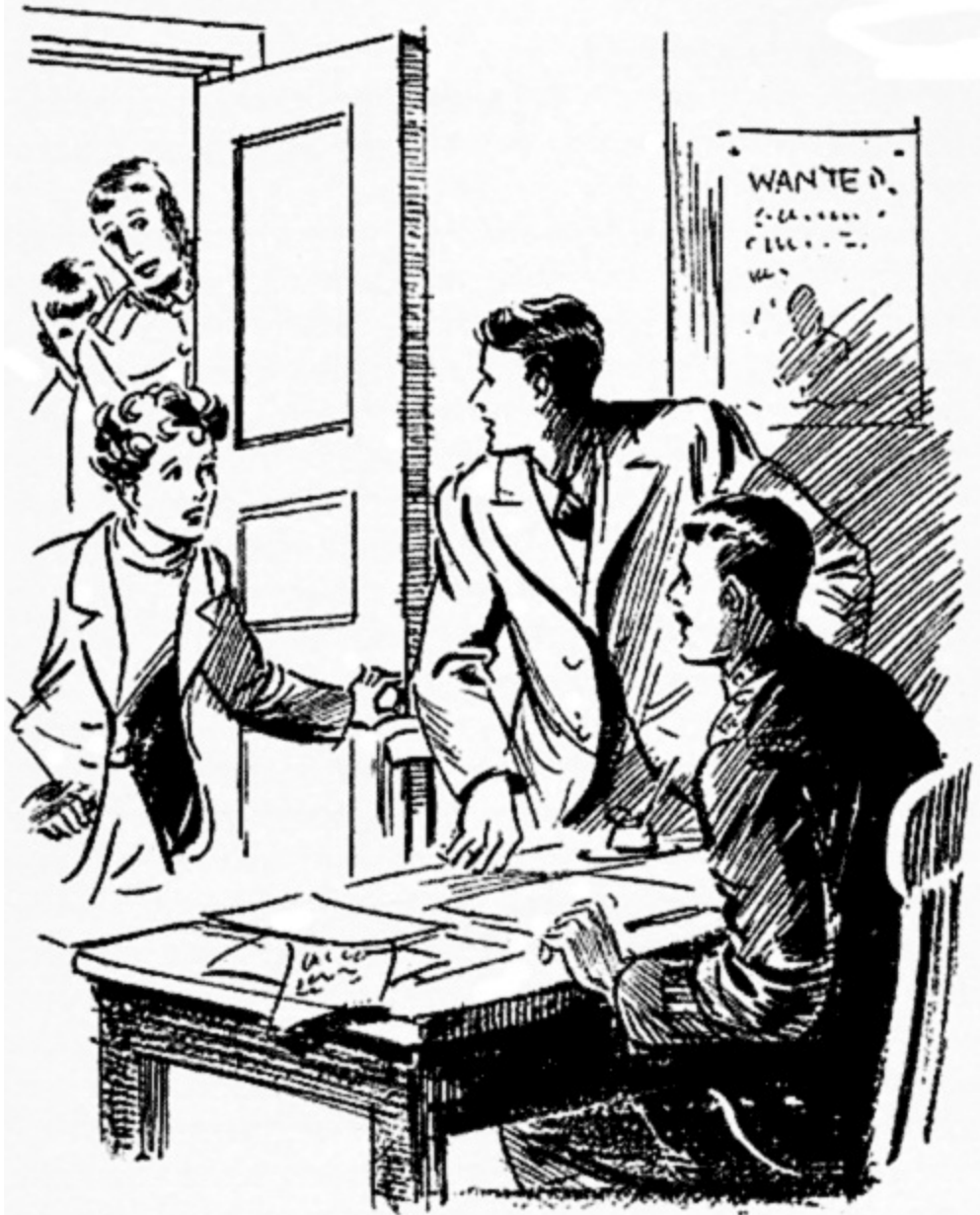
George had flung open the door

"Don't worry, Father," said George. "Really don't worry. We've found them all. How's Mother?"