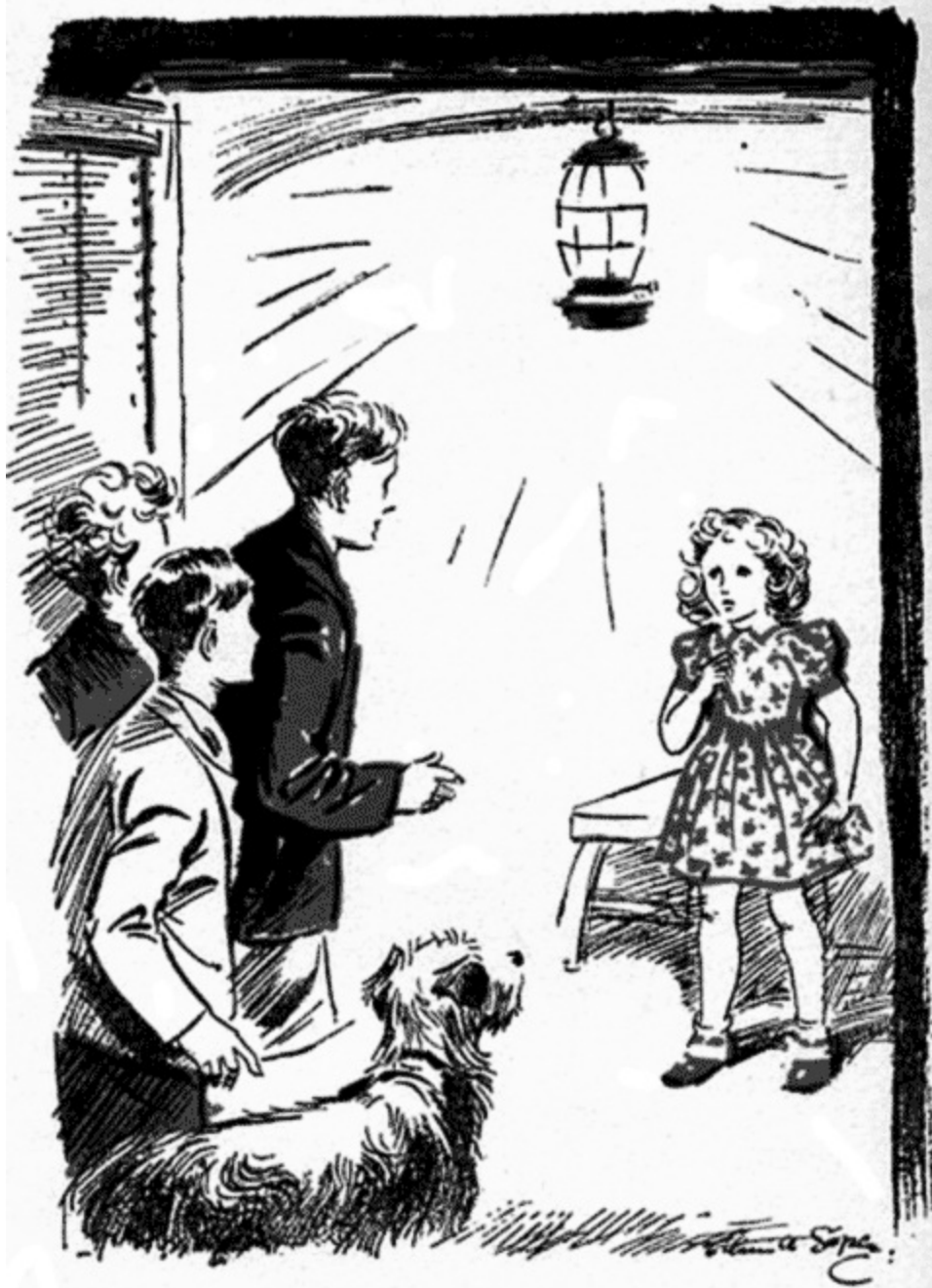
Inside the cave, which was lighted by a lantern, stood a small girl

Dick went to her and put his arm round her. "Everything's all right now," he said. "You're safe. We'll take you back to your mother."