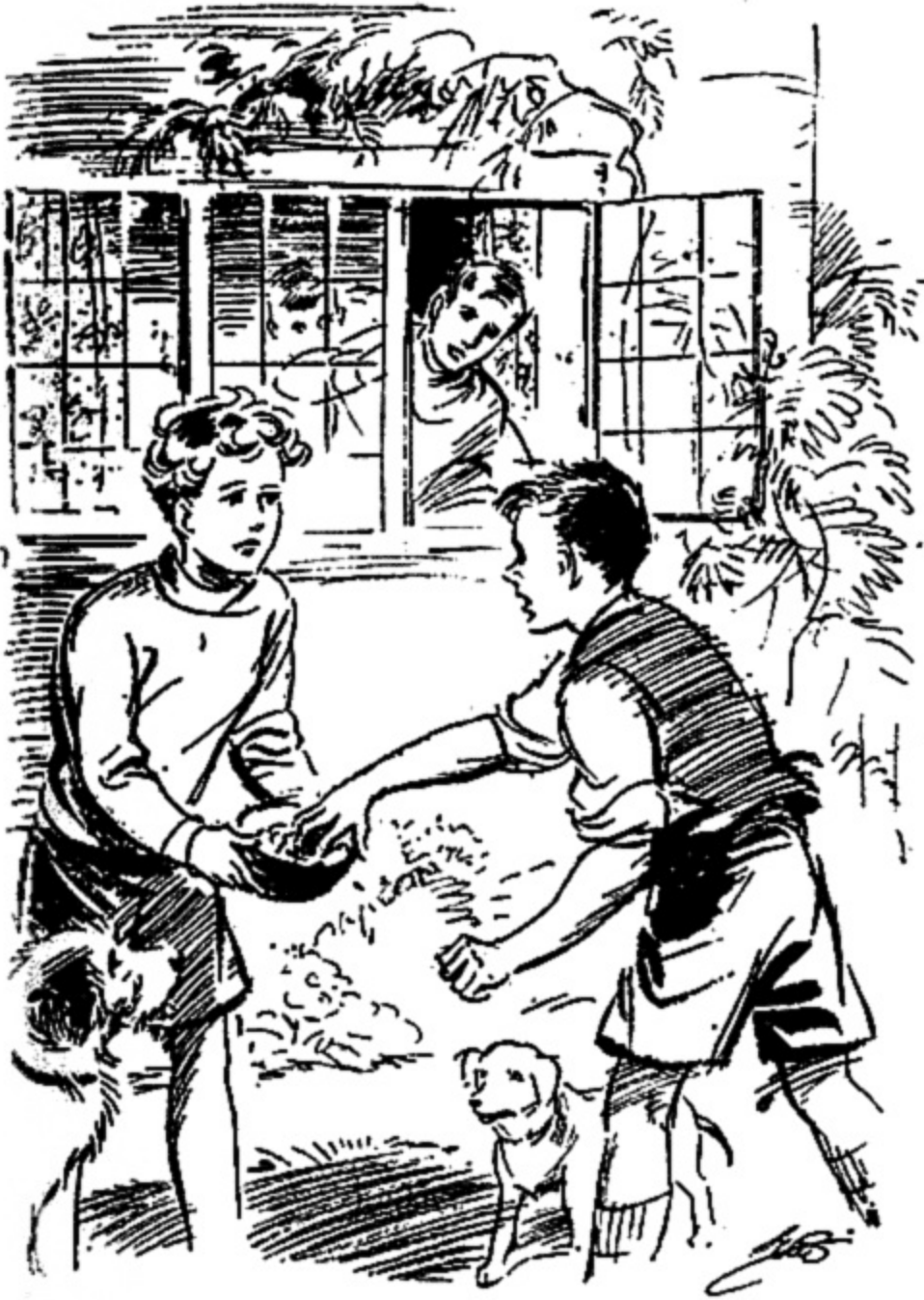
Edgar snatched the bowl from George, almost snarling at her

"No good, old thing!" he said. "You won't get anything out of him. The meat's probably at the back of the kitchen fire by now. From now on, we feed Timothy ourselves with meat bought from the butcher with our own money.